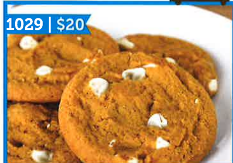
Pumpkin Pie Spice (Especia de la calabaza) NEW FLAVOR!