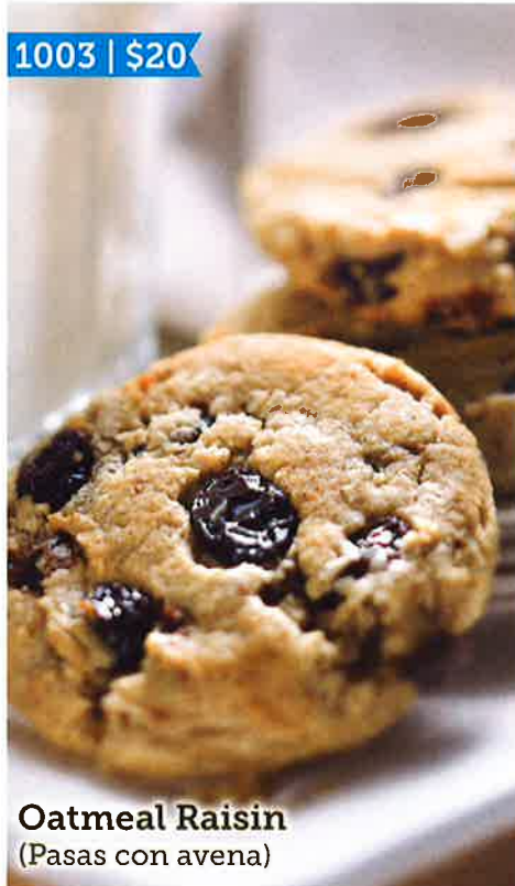
Oatmeal Raisin (Pasas con avena)