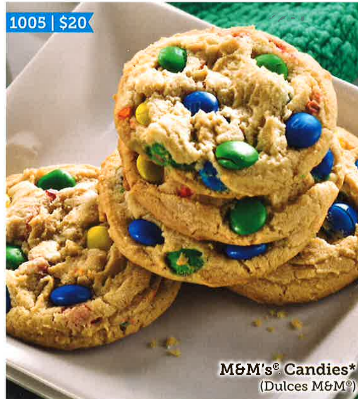
M&M's® Candies* (Dulces M&M®)