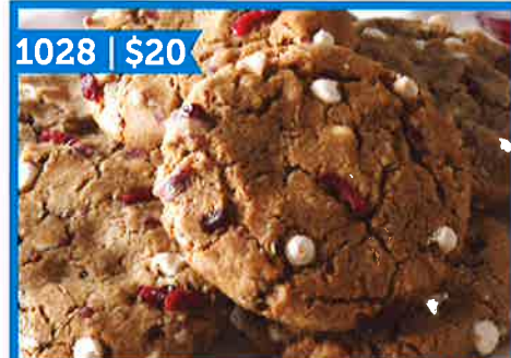
Strawberry Shortcake (Galleta tarta de fresa) NEW FLAVOR!