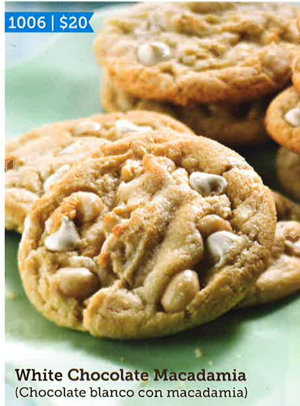
White Chocolate Macadamia (Chocolate blanco con macadamia)